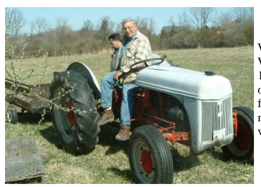
W3GXB and WA3GFX with Bob's 1939 tractor check out the old bases and figure out ow to move them to the work site

The ROHN hinge bases have been removed from the old drive on bases and are ready fo the new style steel base designed by N3ITT with its' bright orange finish